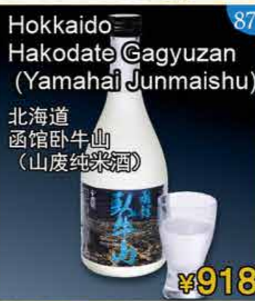
87 Hokkaido Hakodate Gagyuzan (Yamaha Junmaishu) 北海道 函馆卧牛山 (山废纯米酒) ¥918