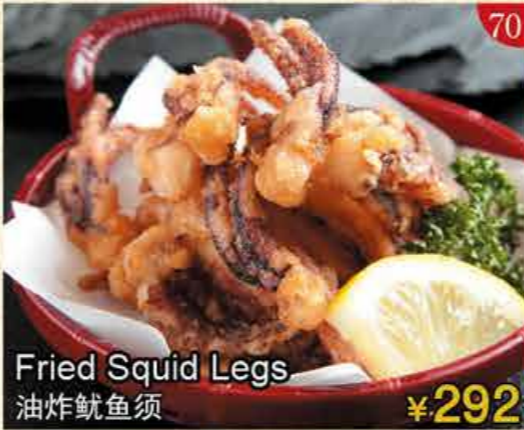
Fried Squid Legs 油炸鱿鱼须