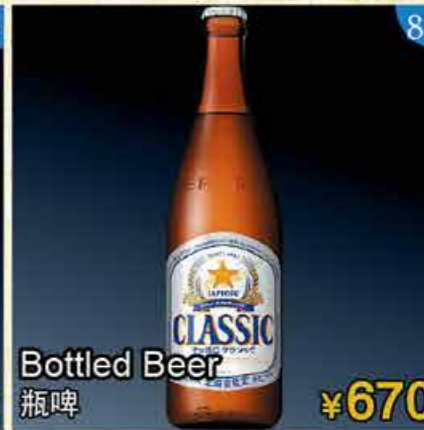
81 Bottled Beer 瓶啤 ¥670