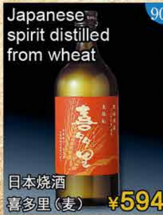
90 Japanese spirit distilled from wheat 日本烧酒 喜多里(麦) ¥594