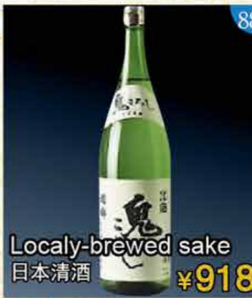
88 Locally-brewed sake 日本清酒 ¥918