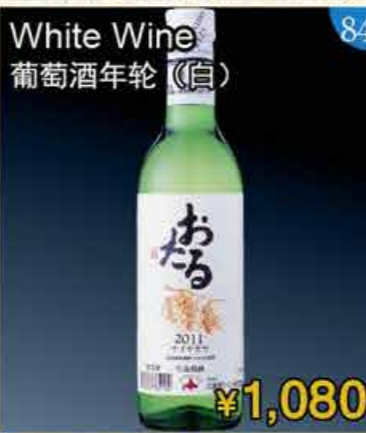
84 White Wine 葡萄酒年轮(白) ¥1,080