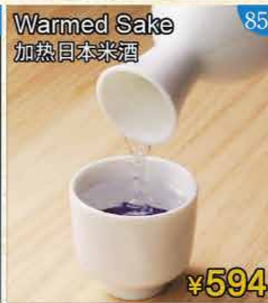
85 Warmed Sake 加热日本米酒 ¥594