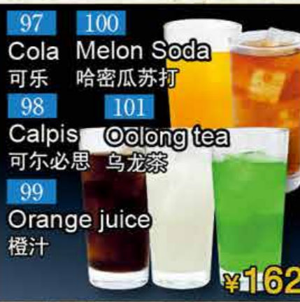
97 Cola 可乐 98 Calpis 可尔必思 100 Melon Soda 哈密瓜苏打 101 Oolong tea 乌龙茶 ¥162