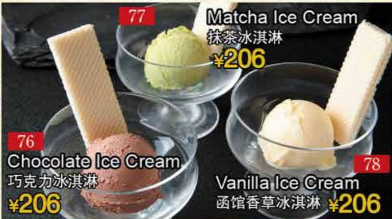
76 Chocolate Ice Cream 巧克力冰淇淋 ¥206