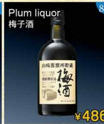
89 Plum liquor 梅子酒 ¥486