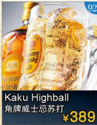
92 Kaku Highball 角牌威士忌苏打 ¥389