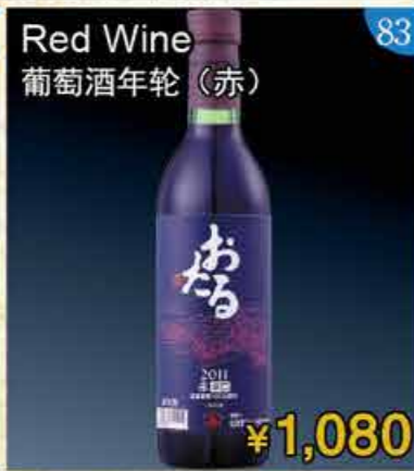
83 Red Wine 葡萄酒年轮(赤) ¥1,080