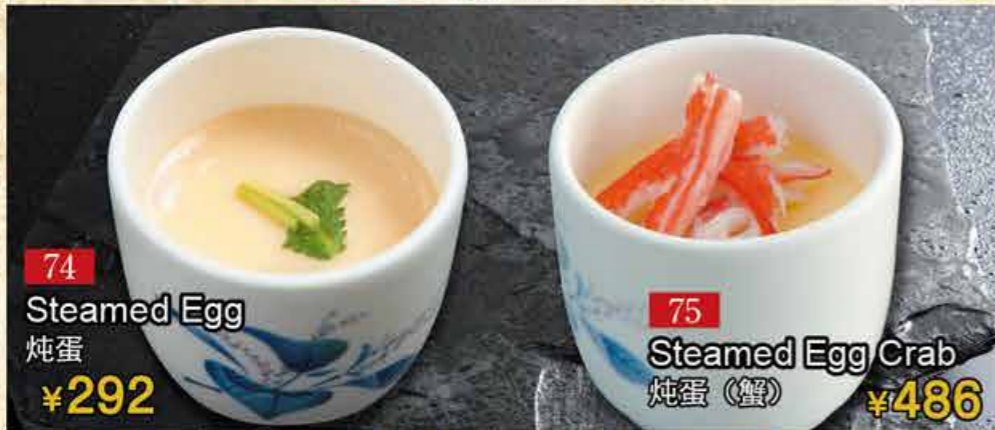
74 Steamed Egg 炖蛋 ¥292