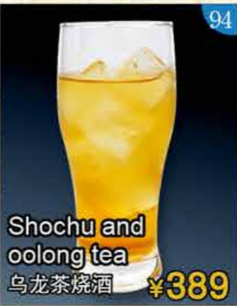
94 Shochu and oolong tea 乌龙茶烧酒 ¥389