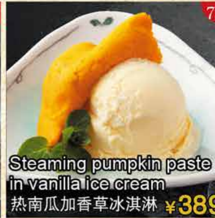
Steaming pumpkin paste in vanilla ice cream 热南瓜加香草冰淇淋