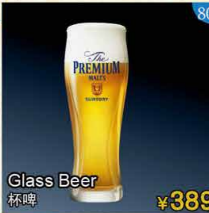
80 Glass Beer 杯啤 ¥389