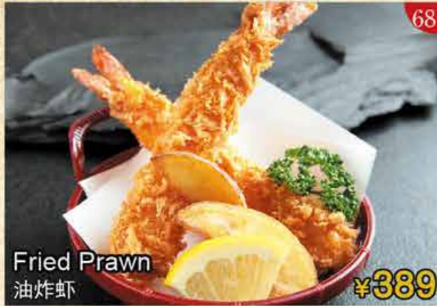
Fried Prawn 油炸虾