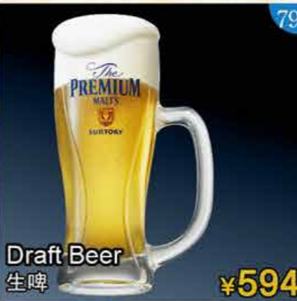
79 Draft Beer 生啤 ¥594