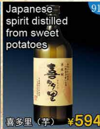
91 Japanese spirit distilled from sweet potatoes 喜多里(芋) ¥594