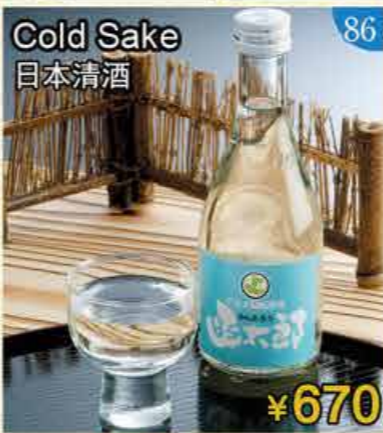
86 Cold Sake 日本清酒 ¥670