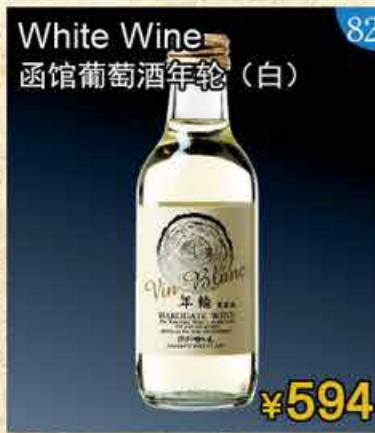
82 White Wine 函馆葡萄酒年轮(白) ¥594