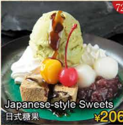
Japanese-style Sweets 日式糖果