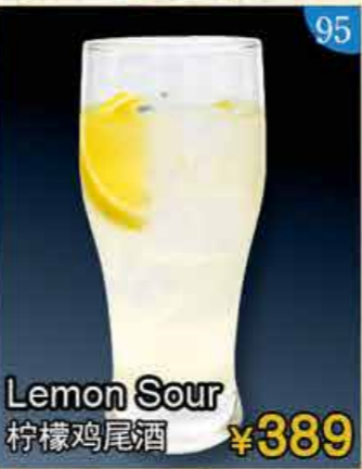
95 Lemon Sour 柠檬鸡尾酒 ¥389