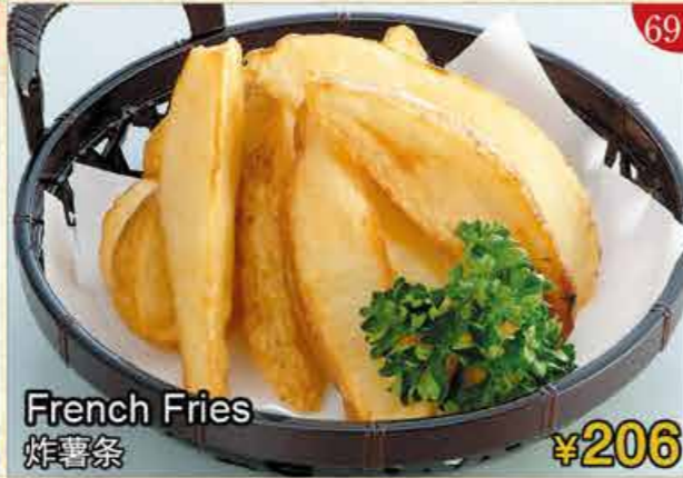
French Fries 炸薯条