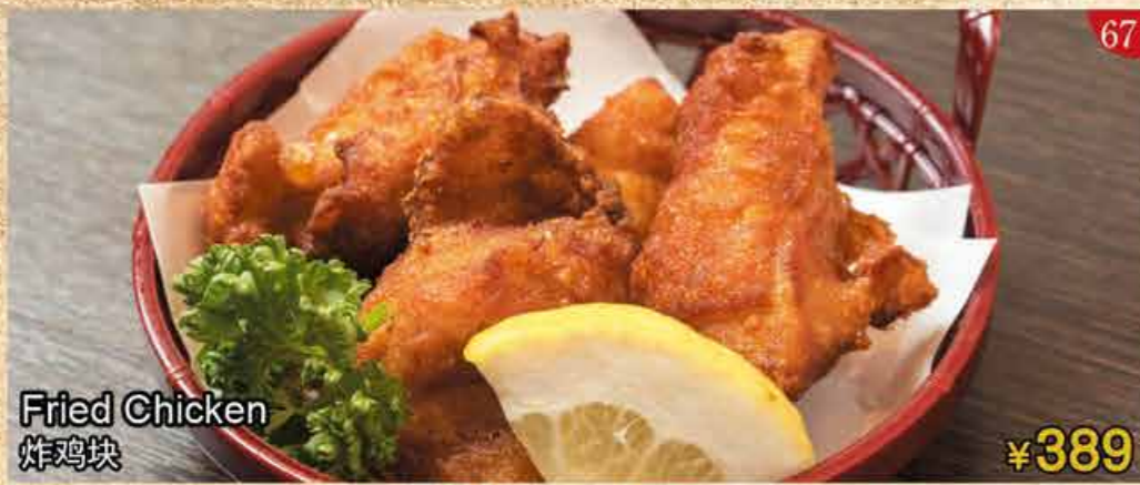
Fried Chicken 炸鸡块