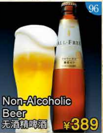
96 Non-Alcoholic Beer 无酒精啤酒 ¥389